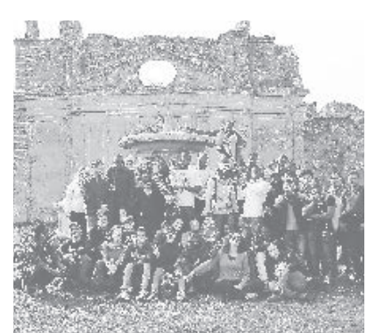
Liberi Nantes, Italy